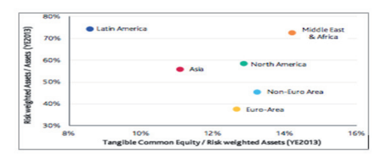
Figure 3. Regulatory Capital Levels vs. Risk-Weighted Asset Densities.